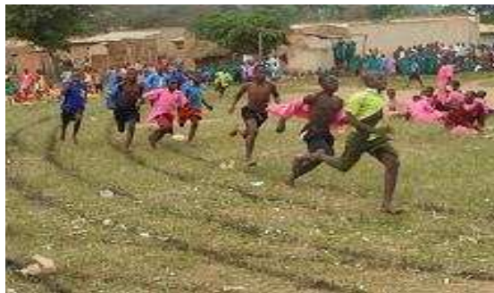
The children are now participating in zonal and regional sports competition