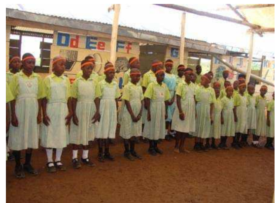
Having school uniforms leads to a good amount of pride in their school and learning.