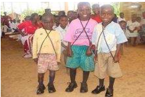
Now having clothing, shoes and school supplies and being fed one meal at school, the children are happy.