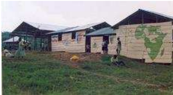
Provisional wood-siding classrooms being used now.

TODAY, August 2008 550 children are being Loved and taught God's Truth