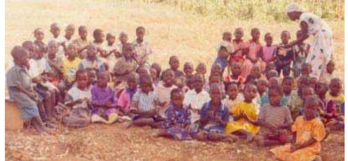
Upper Left: 2005 - Despair and Poverty, no schooling for orphan children.