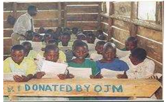
Protected from the sun and rain children learn better.

TODAY, August 2008 550 children are being Loved and taught God's Truth